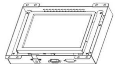
I / O PORT